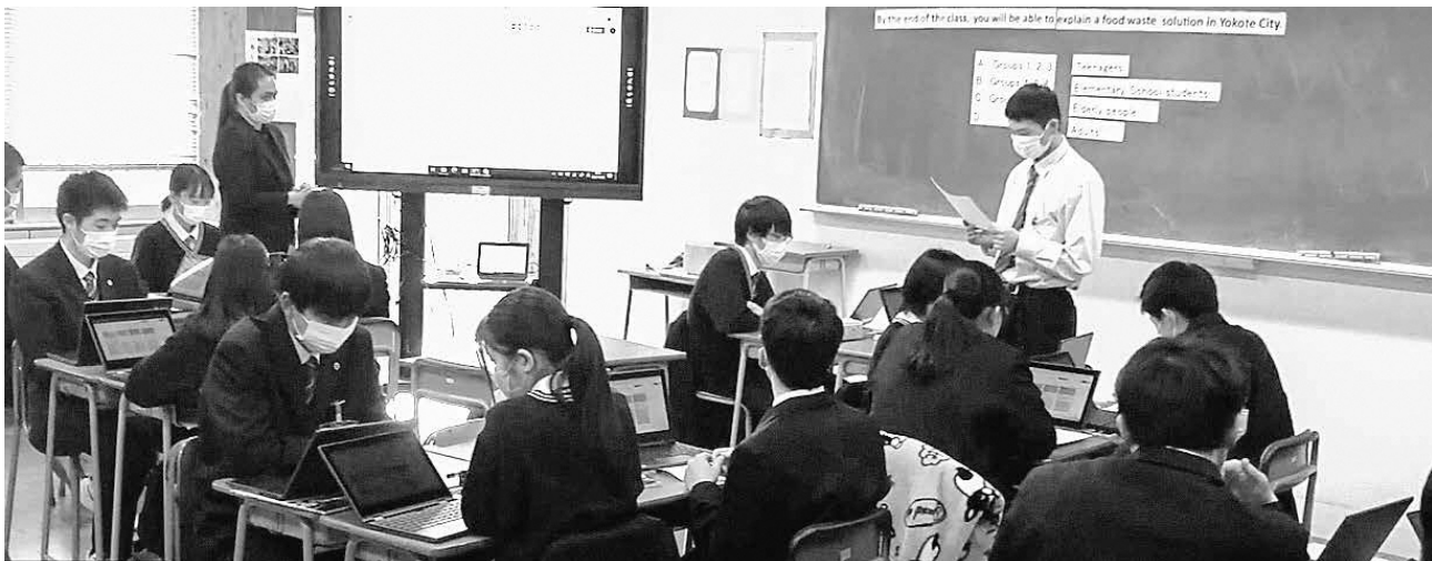
Photo of a group speaker presenting ideas while using his worksheet and the Google Sheet on the Smart TV as reference

In this lesson, the Teachers assigned the ‘Target Practitioner’ category to each group. Apart from that, all the other entries were autonomously inputted by the students. This activity has improved the class in various ways. First, the juxtaposition of the responses encouraged the students to think more carefully about the subject and enter varied ideas. There was evidence of students’ attempt to be more original and think in a more logical way. Second, cooperation from all members has greatly improved as they can see their ideas typed in the template in real time. There was more motivation and initiative to correct the word choice, grammar, or spelling errors committed by the ICT Pro. Through communication and teamwork, productivity in class was achieved. Lastly, the leaders are more confident to present their ideas in class because they are products of a fun and inclusive digital collaboration.