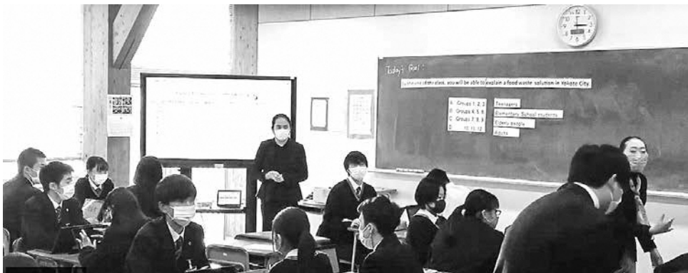
Photo of the Google Sheet Activity being presented to the class