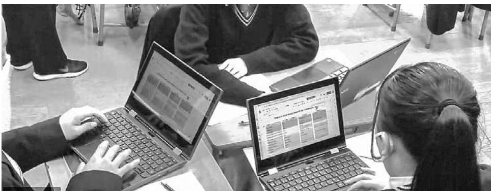
Photo of the students working together to complete their Google Sheet task