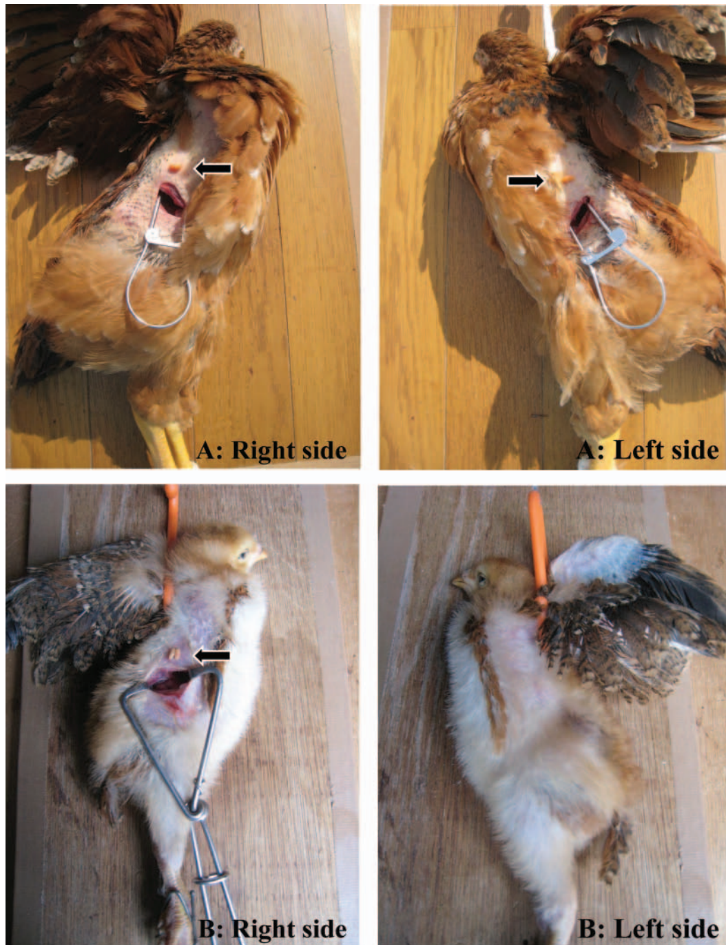
Figure 2. Caponization using tool A or tool B as shown in Figure 1. Tool A: traditional tool used in Japan (tip of the forceps is a spoon type and is 19 mm wide); tool B: improved tool (tip of the forceps is a loop type, 12 mm wide). A) Caponization from both sides using tool A at 8 wk of age. B) Caponization from one side using tool B at 2 wk of age. Arrows indicate testis. Color version available in the online PDF.

age. No significant differences were found among the BW of the 2-wk caponized, 4-wk caponized, and intact groups at any stages. After the chicks were 22 wk old, the BW of all groups was not significantly different. In the daily weight gain from 2 to 14 wk of age, the chicks in the 4-wk caponized group gained the most weight whereas those in the 8-wk caponized group gained the least weight. Moreover, the chicks in the 2- and 4-wk caponized groups gained more weight than those in the 8-wk caponized group across the experiment period (2 to 26 wk of age). Few differences were found in the feed